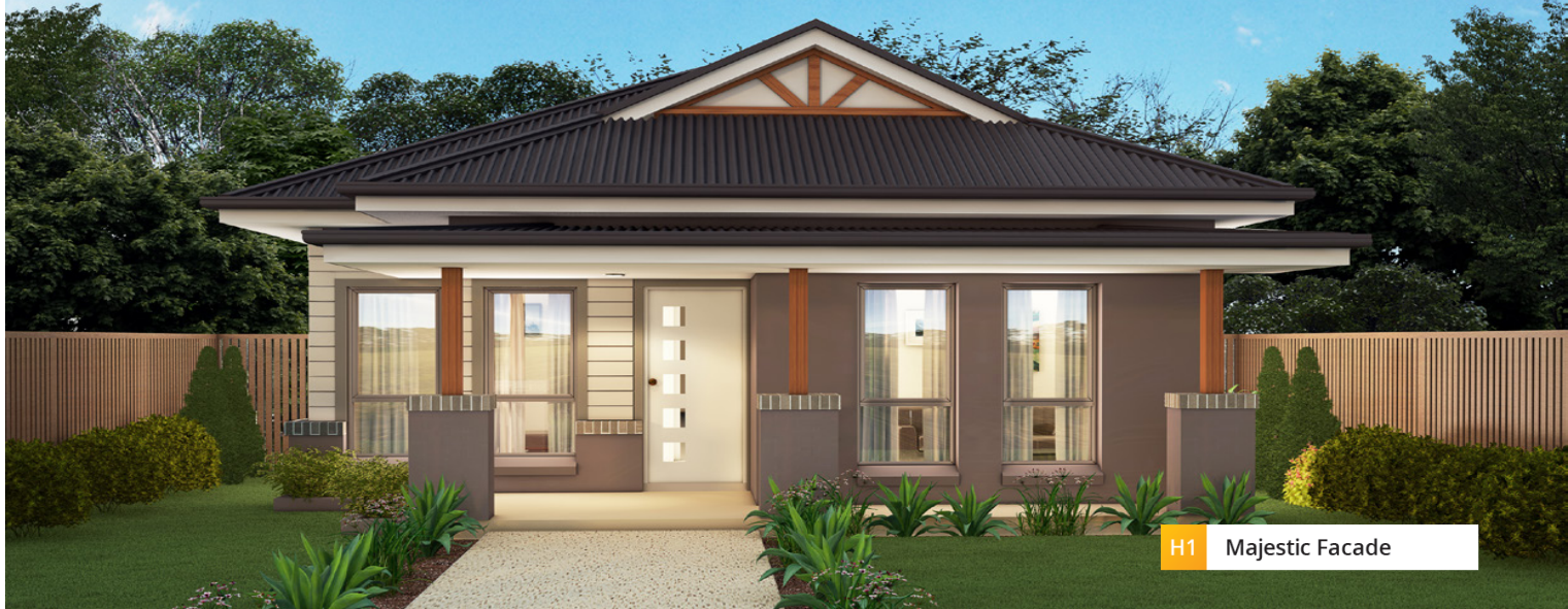
H1 Majestic Facade