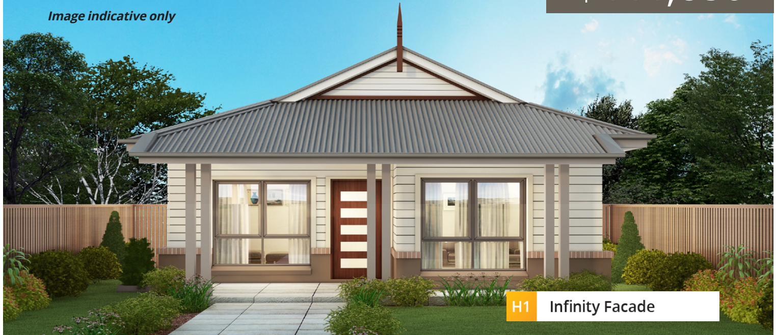
H1 Infinity Facade